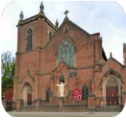
Sacred Heart Church Walmesley Road Leigh WN7 1YE