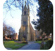
St Joseph's Church Mather Lane Leigh WN7 2PR